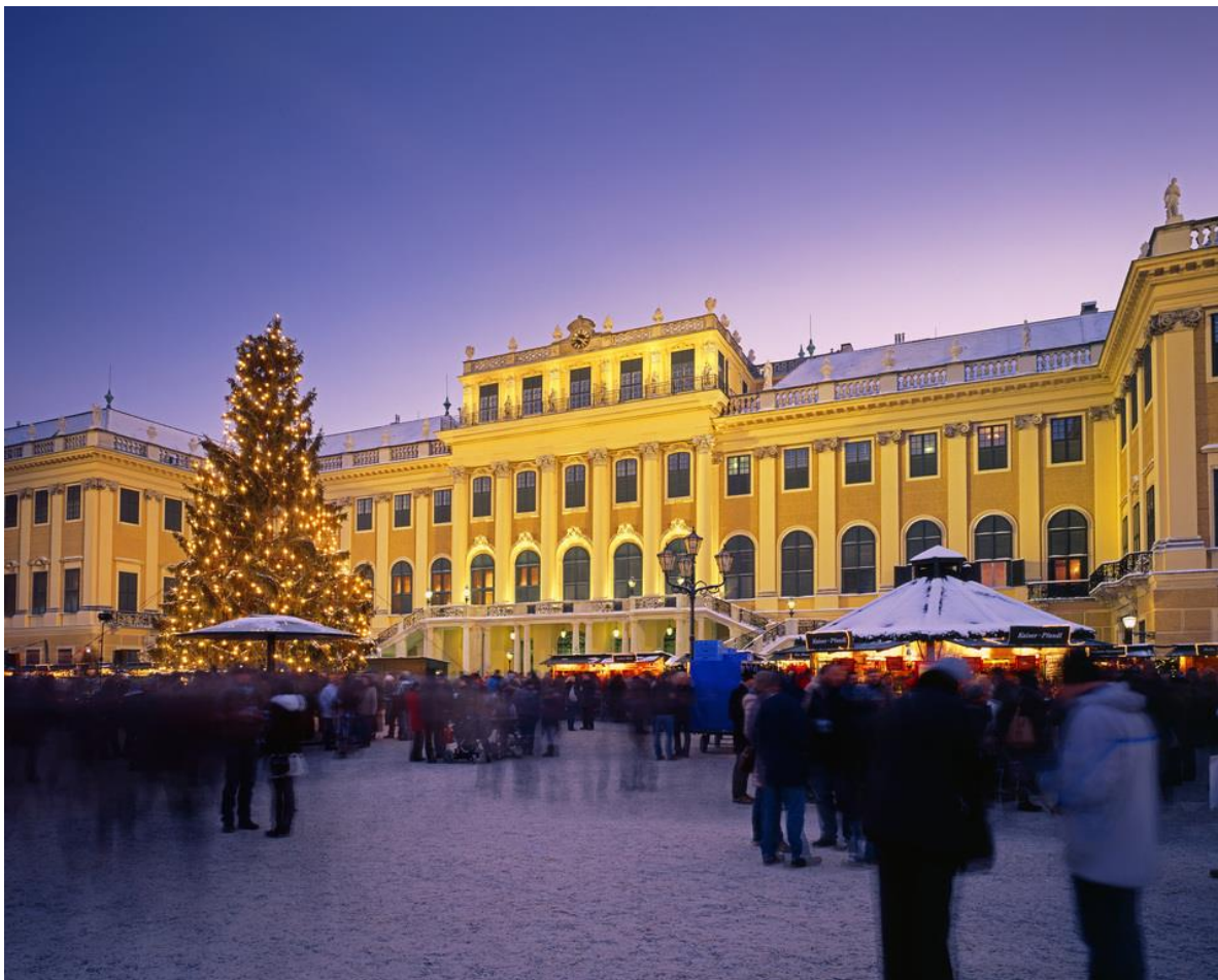
Vienna Christmas Market at Schönbrunn Palace